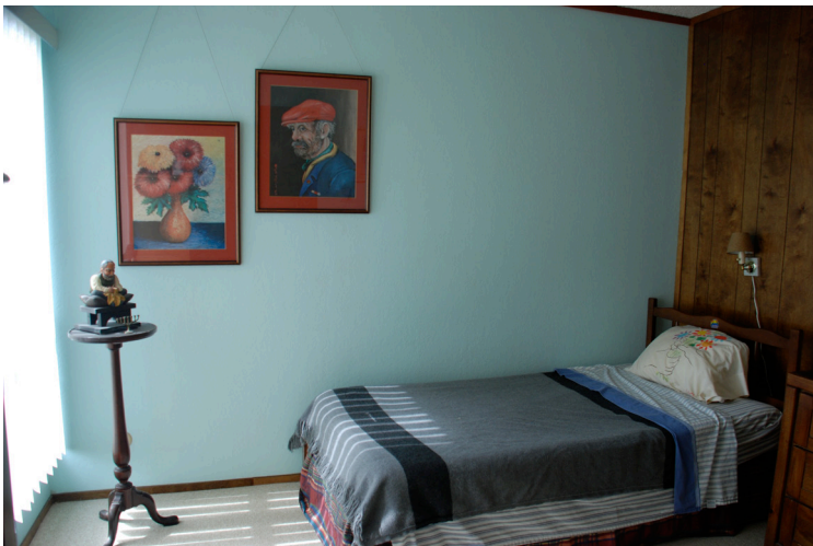
Guest bedroom is conveniently located on the first level.