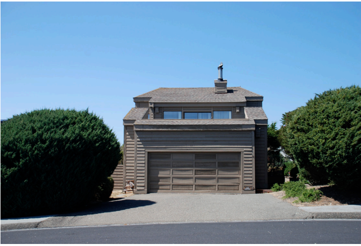
Wide level driveway makes parking easy into the 2 car garage.