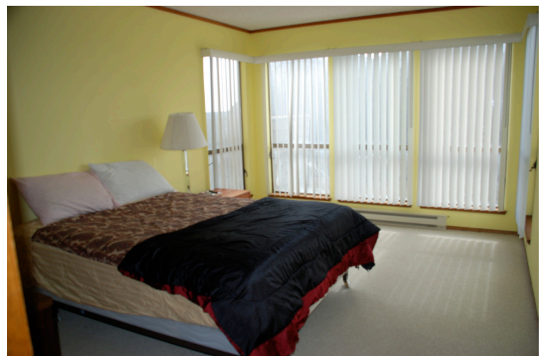
Larger bedroom has a wall of windows facing the south-west which provides abundant light throughout the year.