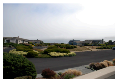
Far left is the view up the 10th fairway.