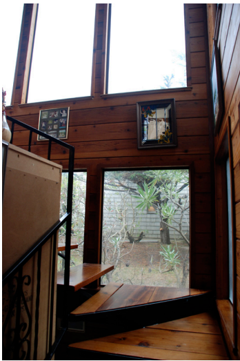
You can be transported back in time to a simpler way of living, enjoy the Swedish wood fireplace.