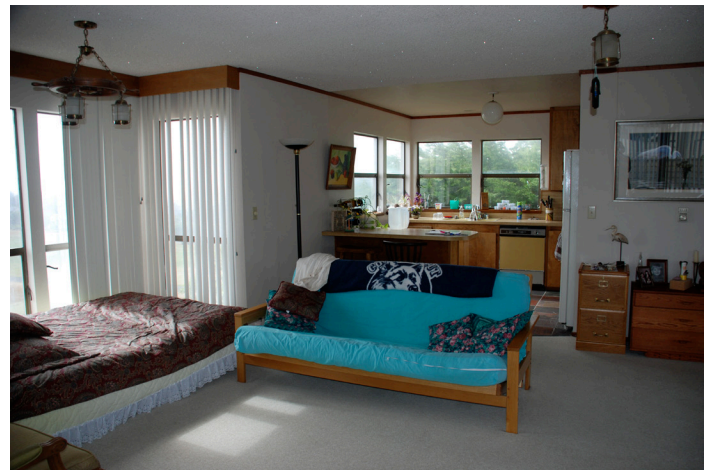
The great room is open and can be decorated as you choose. Create your own space in which to relax and enjoy the coast.