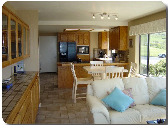
Family room/den continues with more counter & builtins. Think of the buffets brunches you can have with friends.