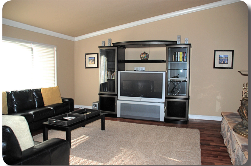
Rich wood flooring welcomes you for entertaining and comfortable living.