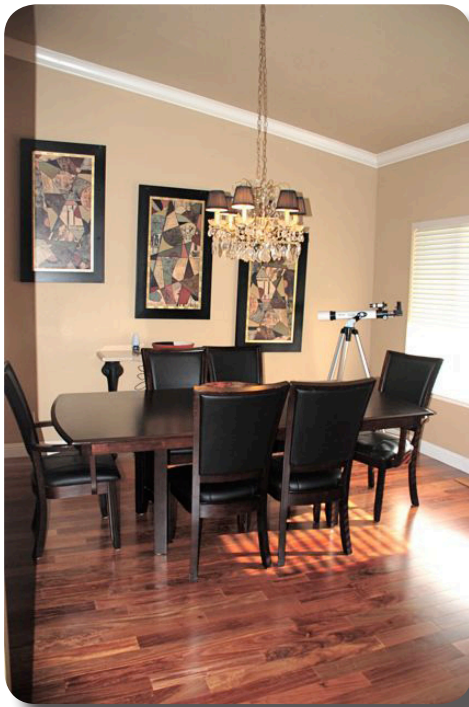
Formal dining room for those special occasions.